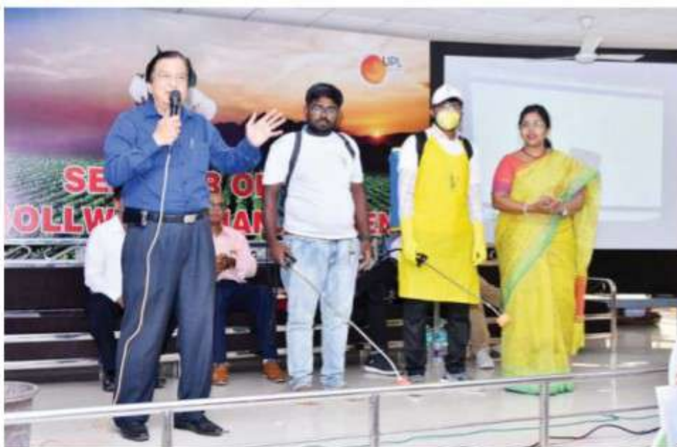
Four programs were held for training the

farmers for taking precautionary steps against attack of pink bollworm – a major pest on cotton on those areas. Starting with Maharashtra the programs were held on 23rd and 25th July, 2019 at Chandrapur and Yavatmal which have faced this ordeal in the past. This was followed by two Farmers